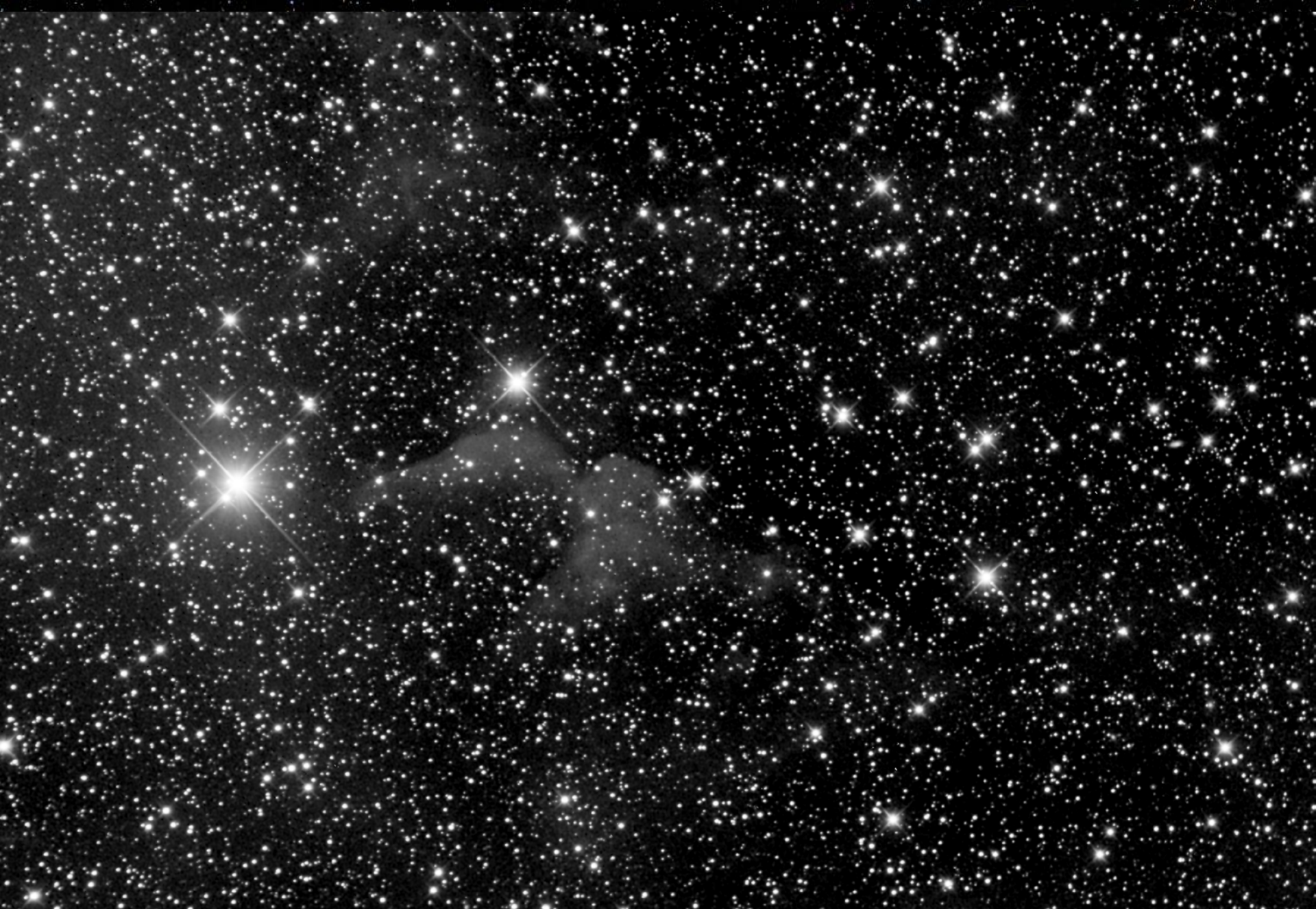
LBN 460 - Flying Bird Nebula - 75 Min Lum - 8" f/4 8300 CCD