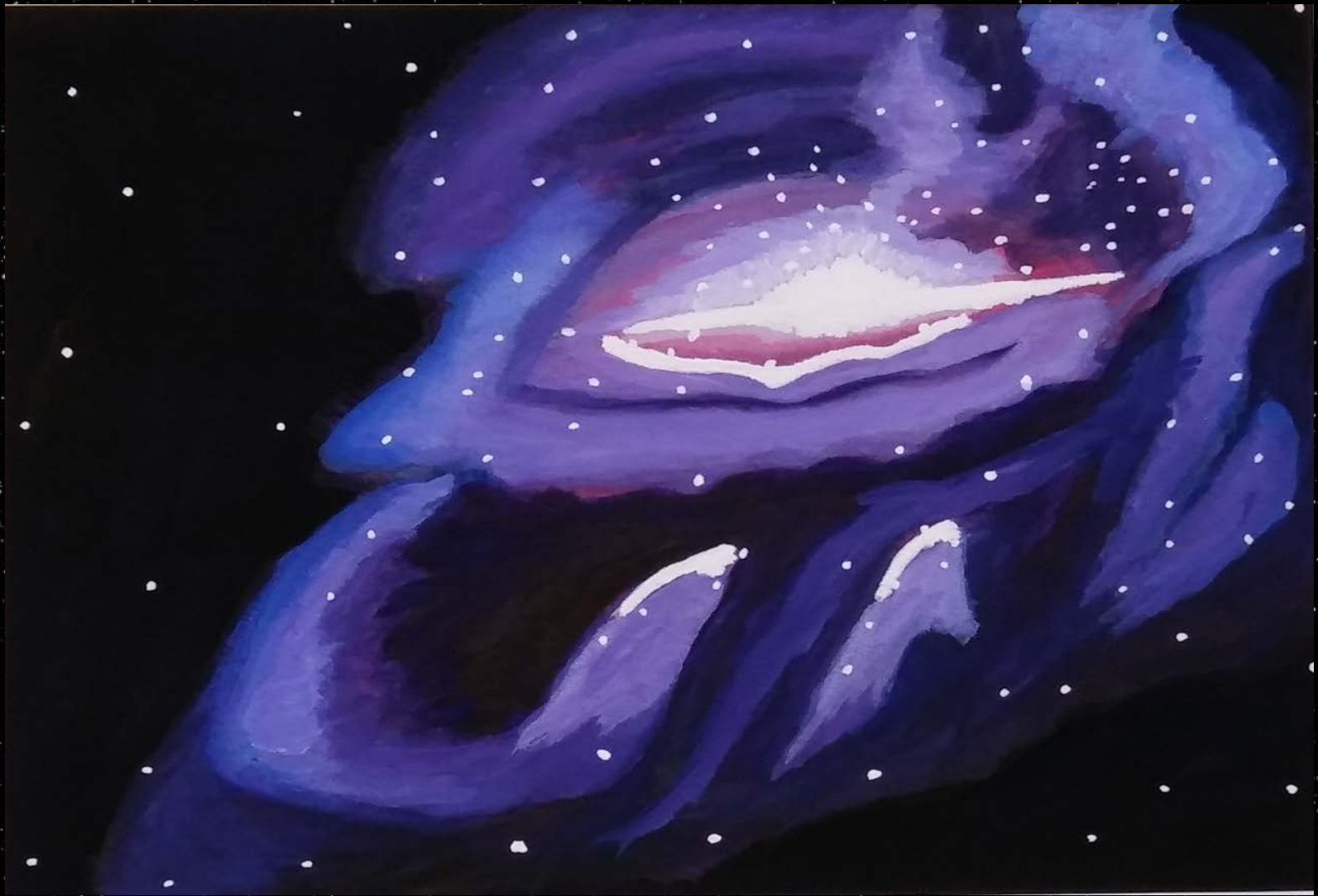
Eye of God Nebula Forest Arnold