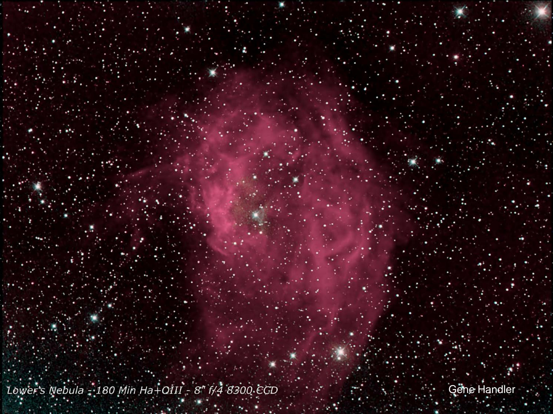
Lower's Nebula - 180 Min Ha+OIII - 8" f/4 8300 CCD